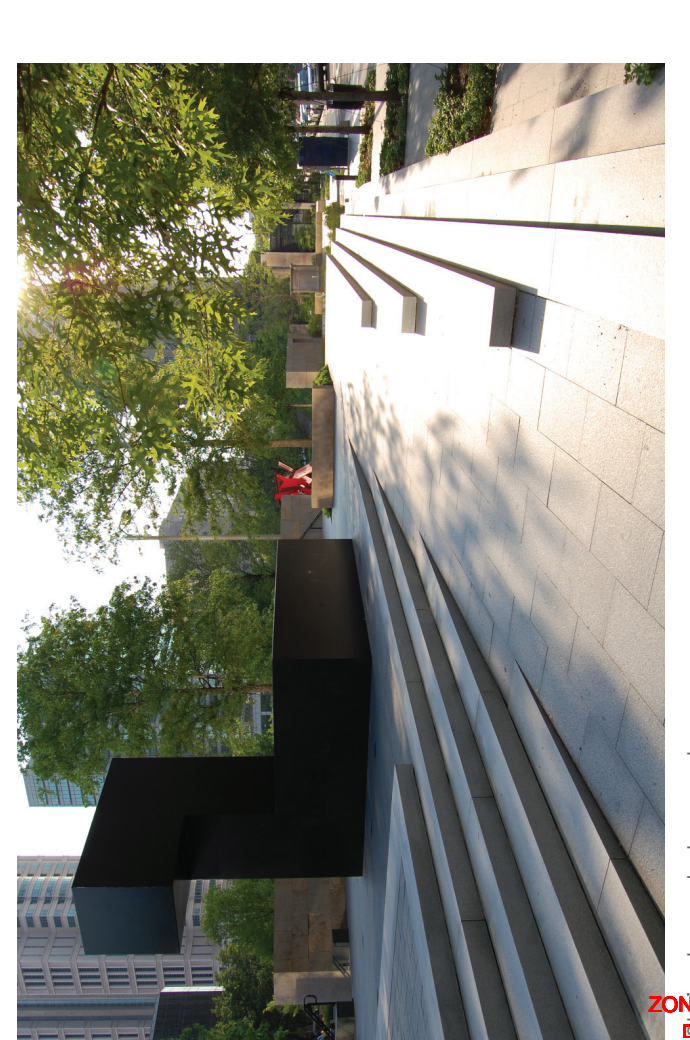
at pond plaza entry District of Columbia CASE NO.13-14 EXHIBIT NO.32A2A17